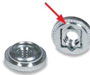
The double dart design is a registered Pencom trademark